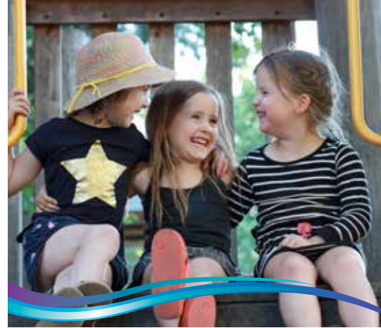
ABOVE: See the quality preschool programs available in Nillumbik at the Combined Preschool Open Day on Saturday 24 February, 11am-3pm. Check the website for a list of participating preschools.

Friday 26 January Australia Day Awards and Citizenship Ceremony Welcome our newest Australian Citizens and celebrate the winners of the 2018 Nillumbik Australia Day Awards. nillumbik.vic.gov.au/AustraliaDay