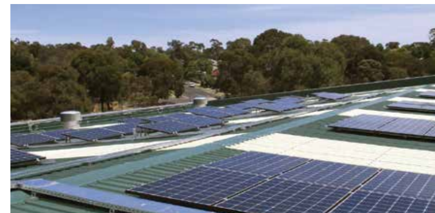
Community Bank Stadium's new solar photovoltaic panels

DETAILS nillumbik.vic.gov.au/environment or call Nillumbik's Land Management Officer on 9433 3207