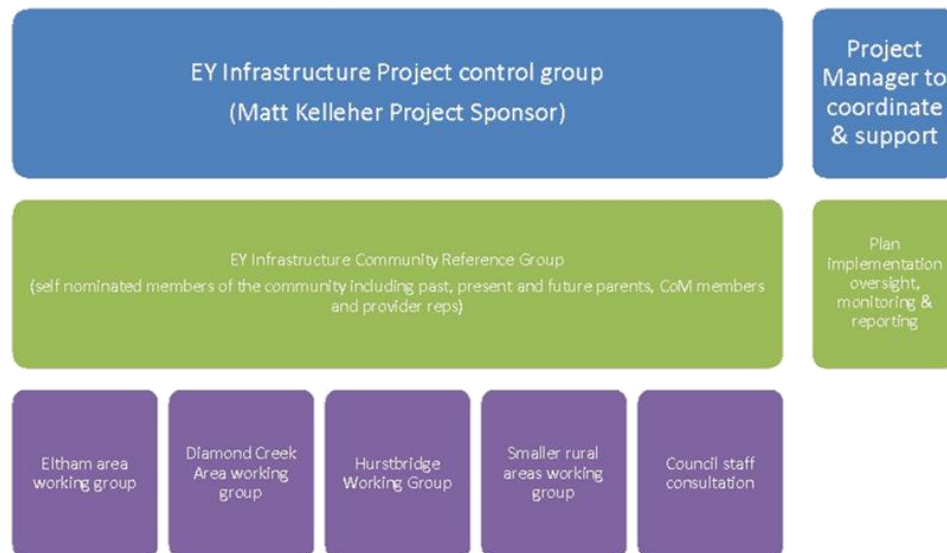
Diagram 1 describes the proposed structural framework for consultation for the EY Infrastructure Plan development.