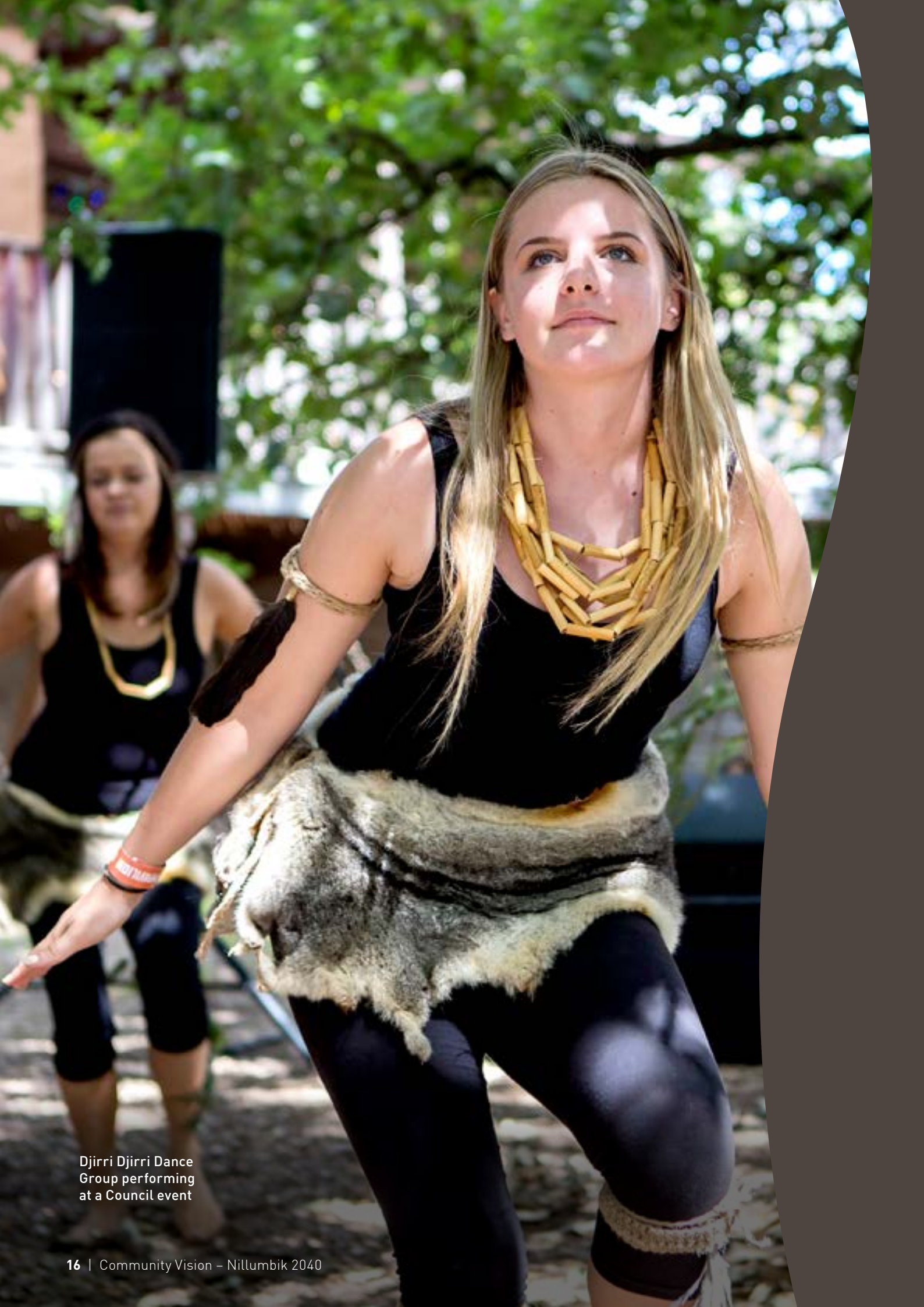
Djirri Djirri Dance Group performing at a Council event