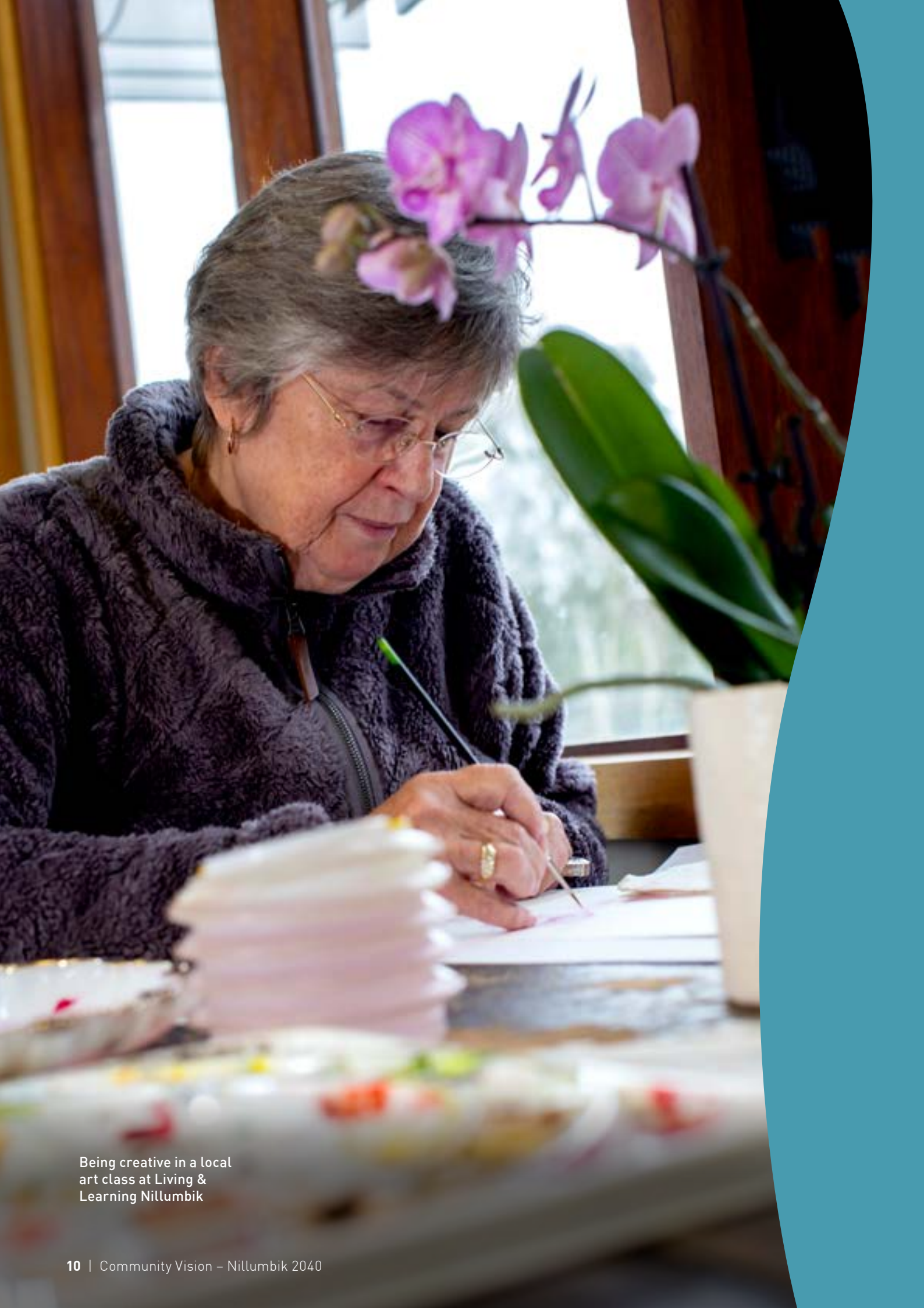
Being creative in a local art class at Living & Learning Nillumbik