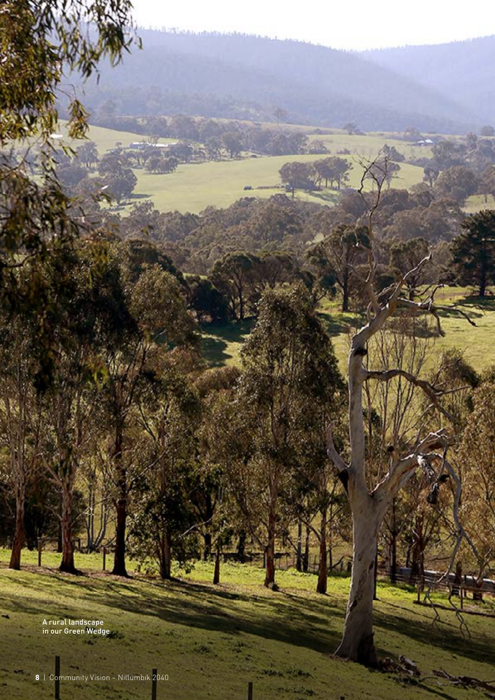
A rural landscape in our Green Wedge