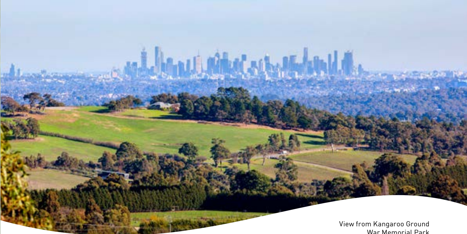
View from Kangaroo Ground War Memorial Park