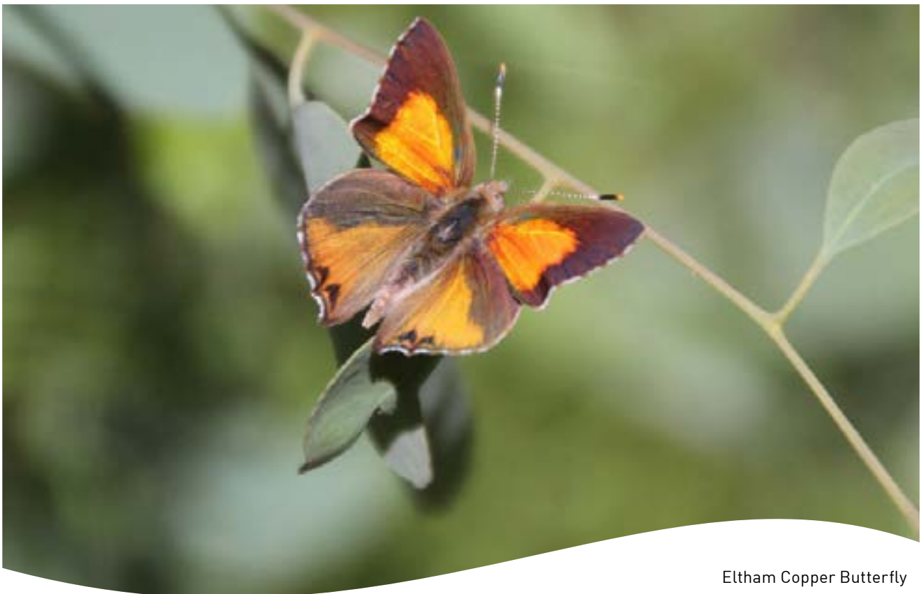
Eltham Copper Butterfly

Additional information about Nillumbik's native animals can be found at nillumbik.vic.gov.au/native-animals